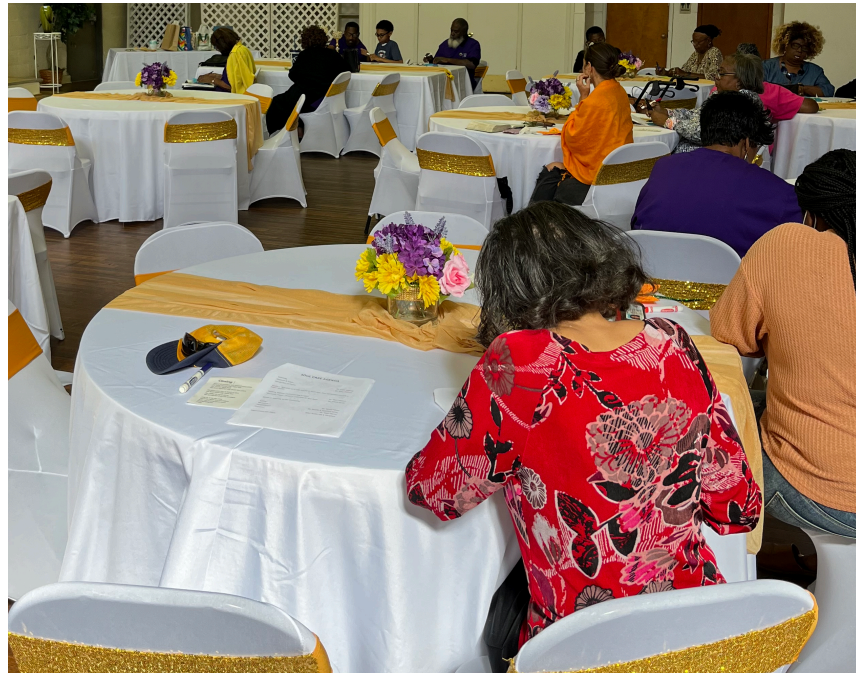
New Zion UWF Soul Care Retreat